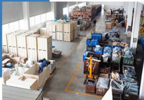
Packaging Workshop ▲