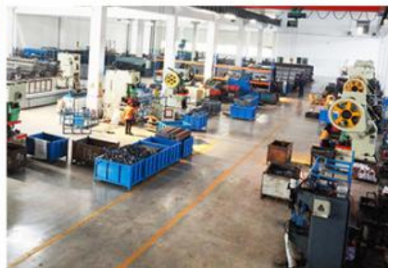
Stamping Workshop ▼