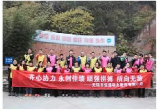
Our Team ▲