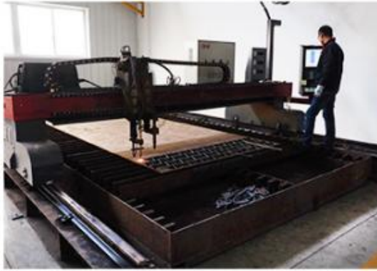
CNC Cutting ▲