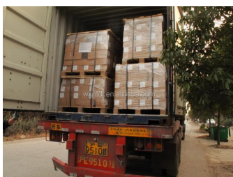
5. Professional shock