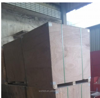
2. Suitable carton size