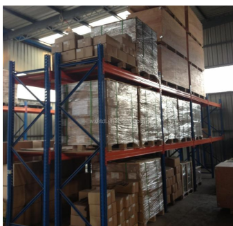
1. Special logistics packaging