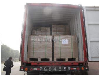
4. Professional placement