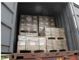
6. Complete package