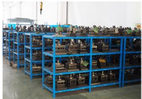
Mold Library ▲