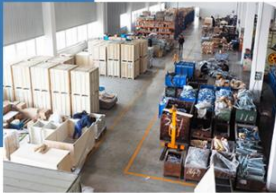
Packaging Workshop ▲