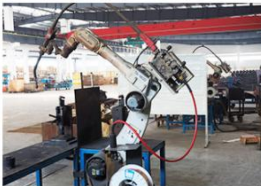
Welding Workshop ▲